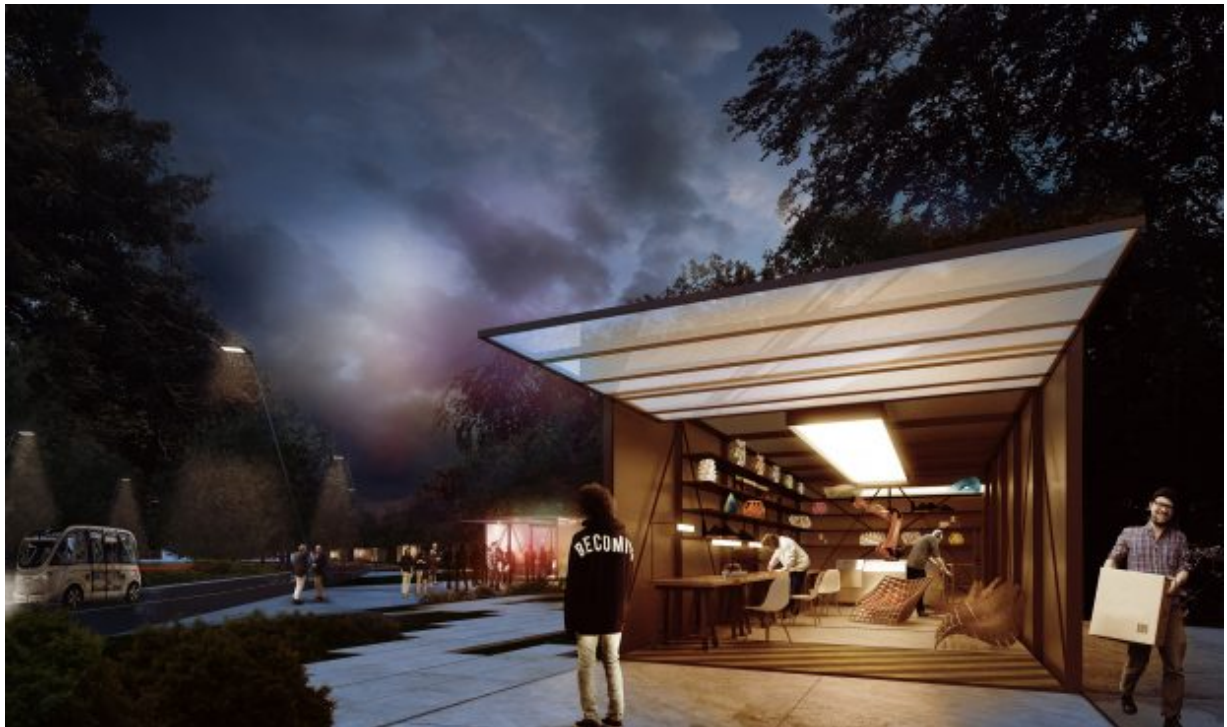
Carlo Ratti Associati

In addition to the co-living blocks, there will also be garage-like spaces like the one below, which could be used as homes, workspaces, or shops. Ratti says there is already a waitlist for people who want to live in the commune.