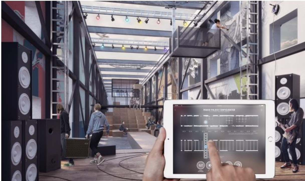
Carlo Ratti Associati

A giant maker space, which will include areas for making music and other art, will sit at the center of the commune.