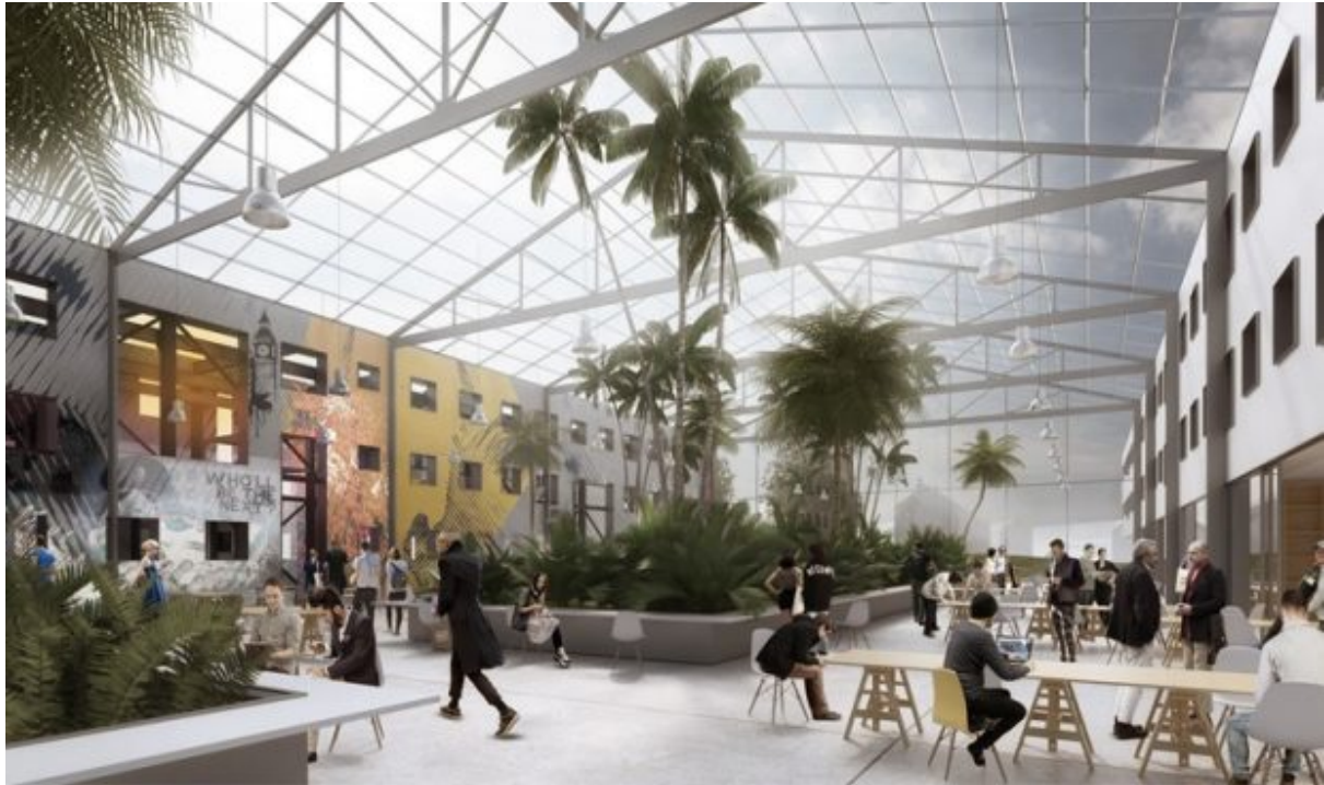
Carlo Ratti Associati

A former US military village in Heidelberg, Germany will soon get a makeover.