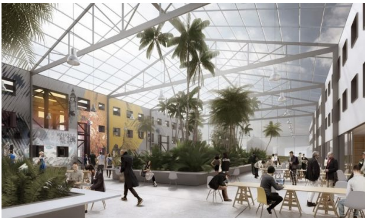
Carlo Ratti Associati

30% to 40% of the commune will be shared spaces. Pictured below is a communal dining area with shared kitchens. The development will also launch a car-sharing service and shuttles that connect to Heidelberg's center.